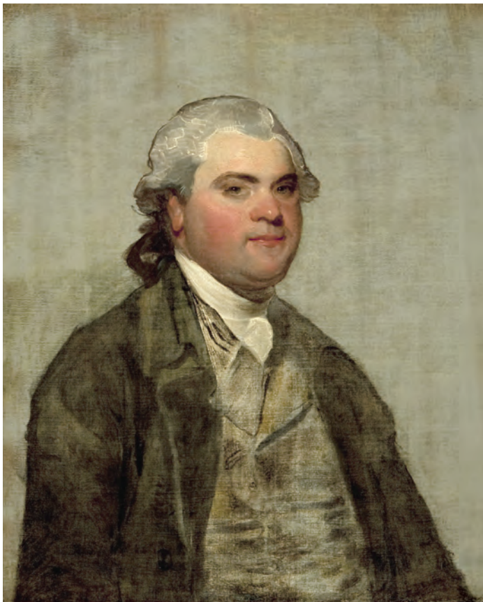
Unfinished portrait of a Man , c. 1785. Oil on canvas; Gilbert Stuart, American, 1755-1828