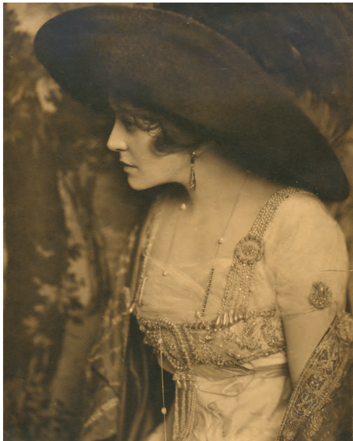
Portrait of Julia Dean, c. 1914. 9¼ x 7¼ in.