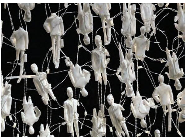
Kenya (Robinson), Installation Image , 2017, © Kenya (Robinson) Image, courtesy of Pioneer Works, Photo by Dan Bradica.