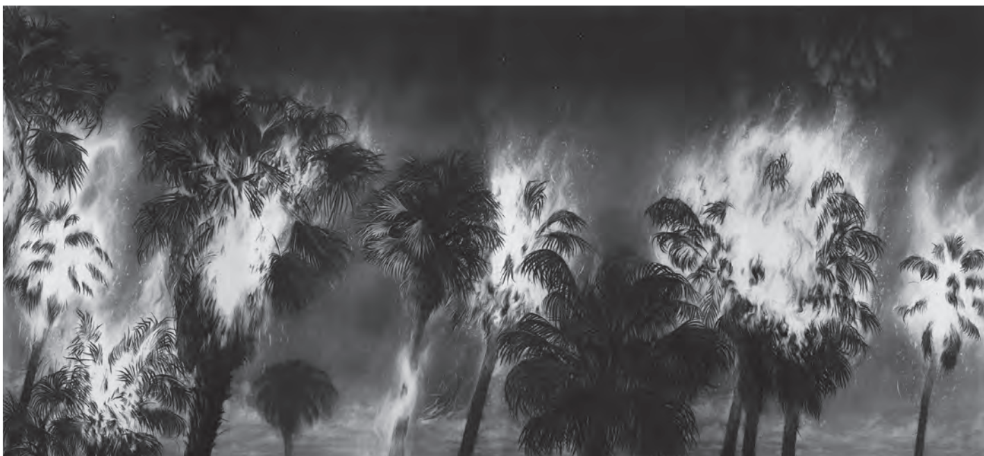
Gonzalo Fuenmayor, Tropicalypse , 2017, Charcoal on paper 84 x 180 inches. © Gonzalo Fuenmayor Image, courtesy of the artist and Dotfiftyone Gallery.