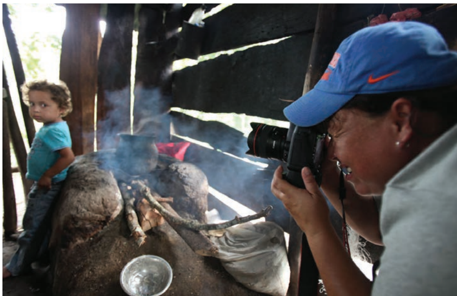
DEBI SPRINGER/FOOD FOR THE POOR