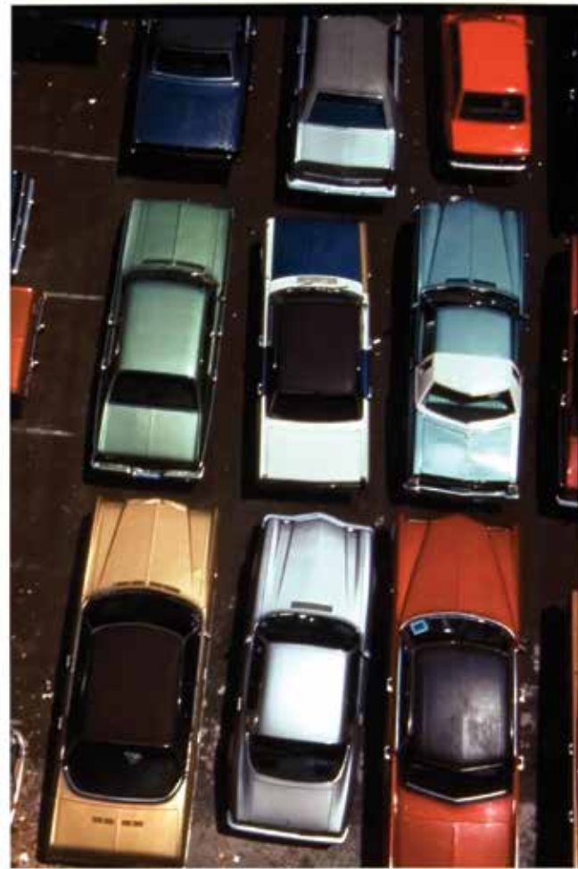
Thief of Baghdad , 2007, Mary Heilmann, woodcut, linocut and archival pigment inkjet on paper, 28.875" x 38.375"