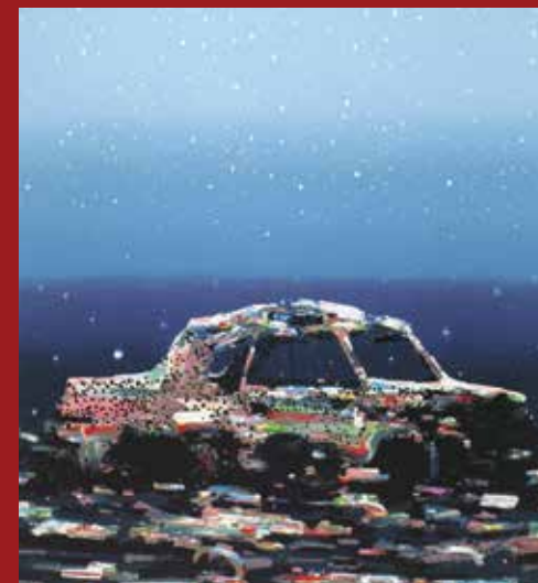
Car , 2007, Tomory Dodge, screenprint on paper, 34.75" x 31.5"

Contemporary American Graphics Collection Orlando Museum of Art June 15 to 30 407.896.4231 • omart.org