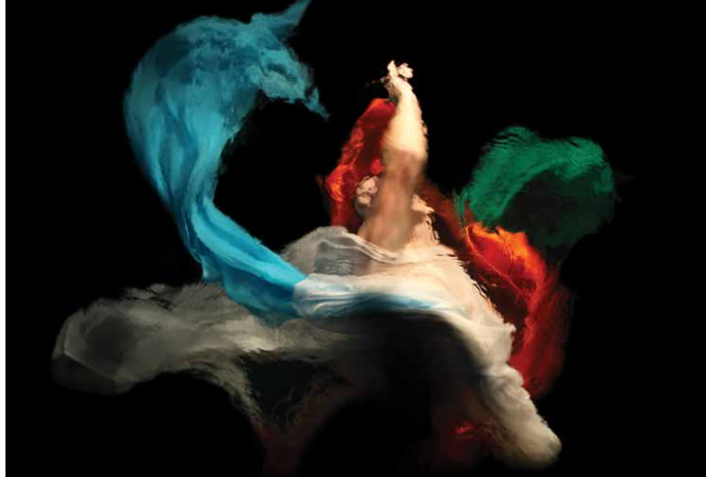
Some Day I'll Fly Away , Christy Lee Rogers