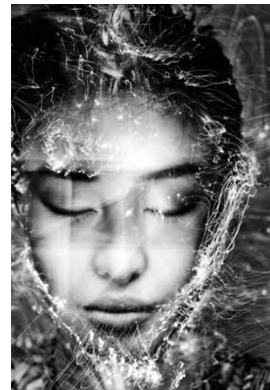
Perpetual Peace , Aurora Crowley