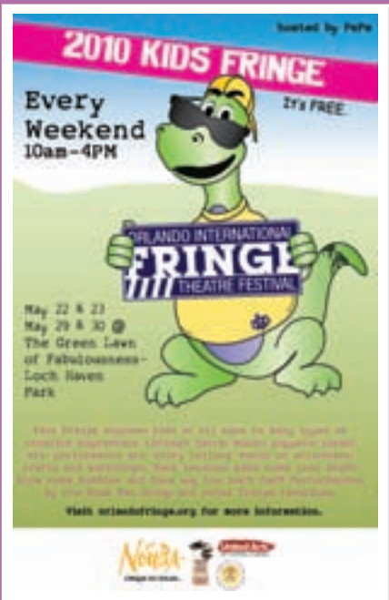
KIDS FRINGE takes place on weekends from 10 a.m. to 4 p.m.